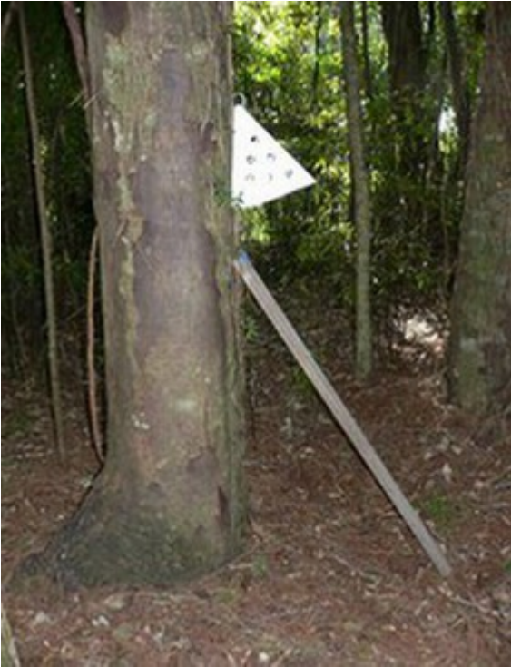
Using a Running Board on a Larger Tree. Board at 50 deg. 200 – 240mm from the Top of the board to the Bottom of the Trap.