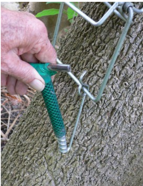
If you need to adjust curve in trigger drill a 4.5 mm hole 20 mm deep in the end of a piece of steel. Don't use pliers they mark the wire