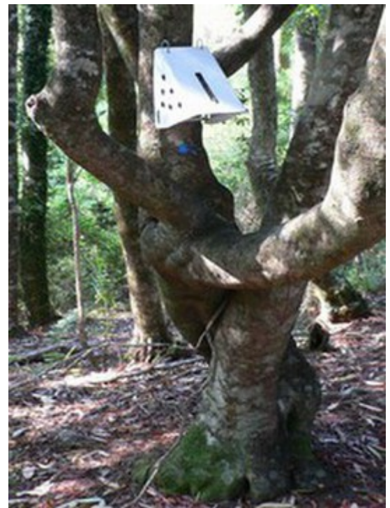
Trap Installation using a fork in Tree Possum can sit and check out the Trap and lure.