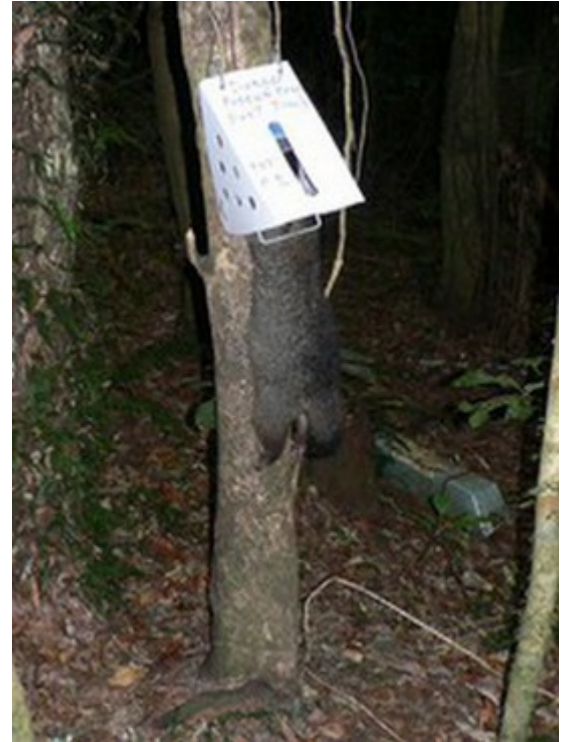
Sentinel Trap mounted on a Tree approx 180mm diameter.